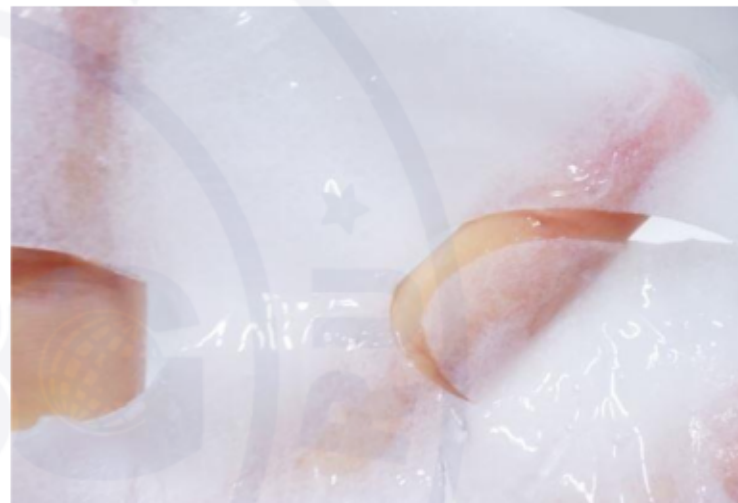
Keep the essence on sheet