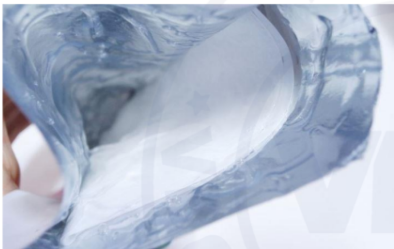
Overflow Essence before use

Use the rest of Essence on neck, hand, feet etc.